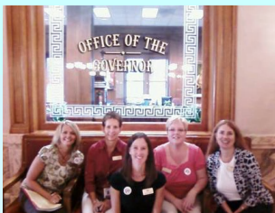
Officers from McKendree ES PTA attend the Georgia PTA Advocacy Conference on September 19

Brookwood ES PTA - Area I Gwinnett Council Knight ES PTA - Area I Gwinnett Council R.D. Head ES PTA - Area I Gwinnett Council